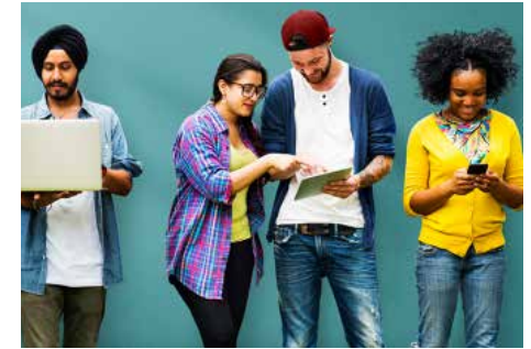
Choosing subjects and courses at 18