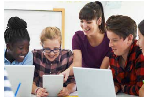
Choosing subjects and courses at 16