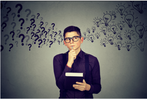
How to choose the right subject or course