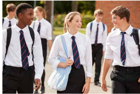
Choosing subjects in Year 8 and 9