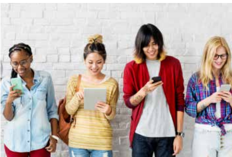
Options at 16